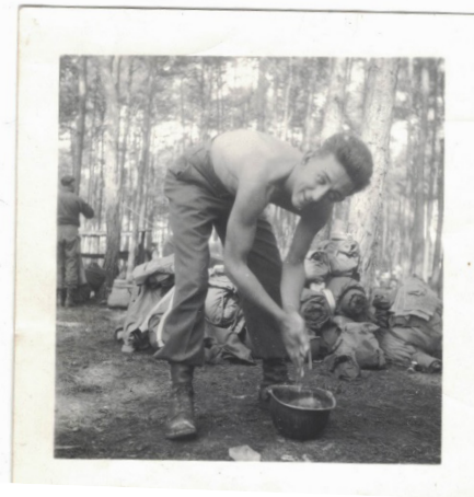
Camping out, Army style

The radio truck in which he almost died (the guy in the T-shirt saved him).