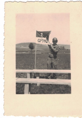
General Patton's Headquarters